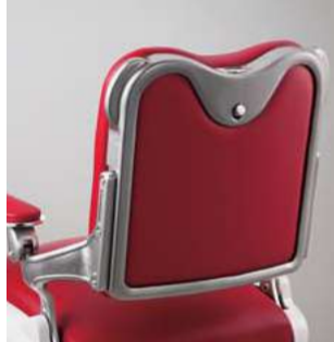
Metallic Silver(Upgrade Option)