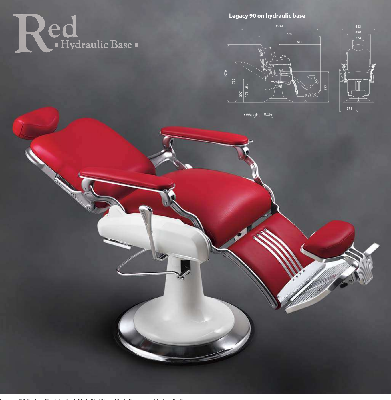
Legacy 90 Barber Chair in Red, Metallic Silver Chair Frame on Hydraulic Base