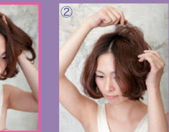
Create floating style by lighty pinching on the top surface and fringe